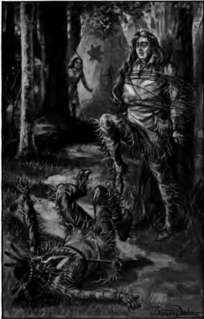
The prisoner suddenly raised his powerful leg, and his foot struck Girty in the pit of the stomach. Page 56 The Spirit of the Border